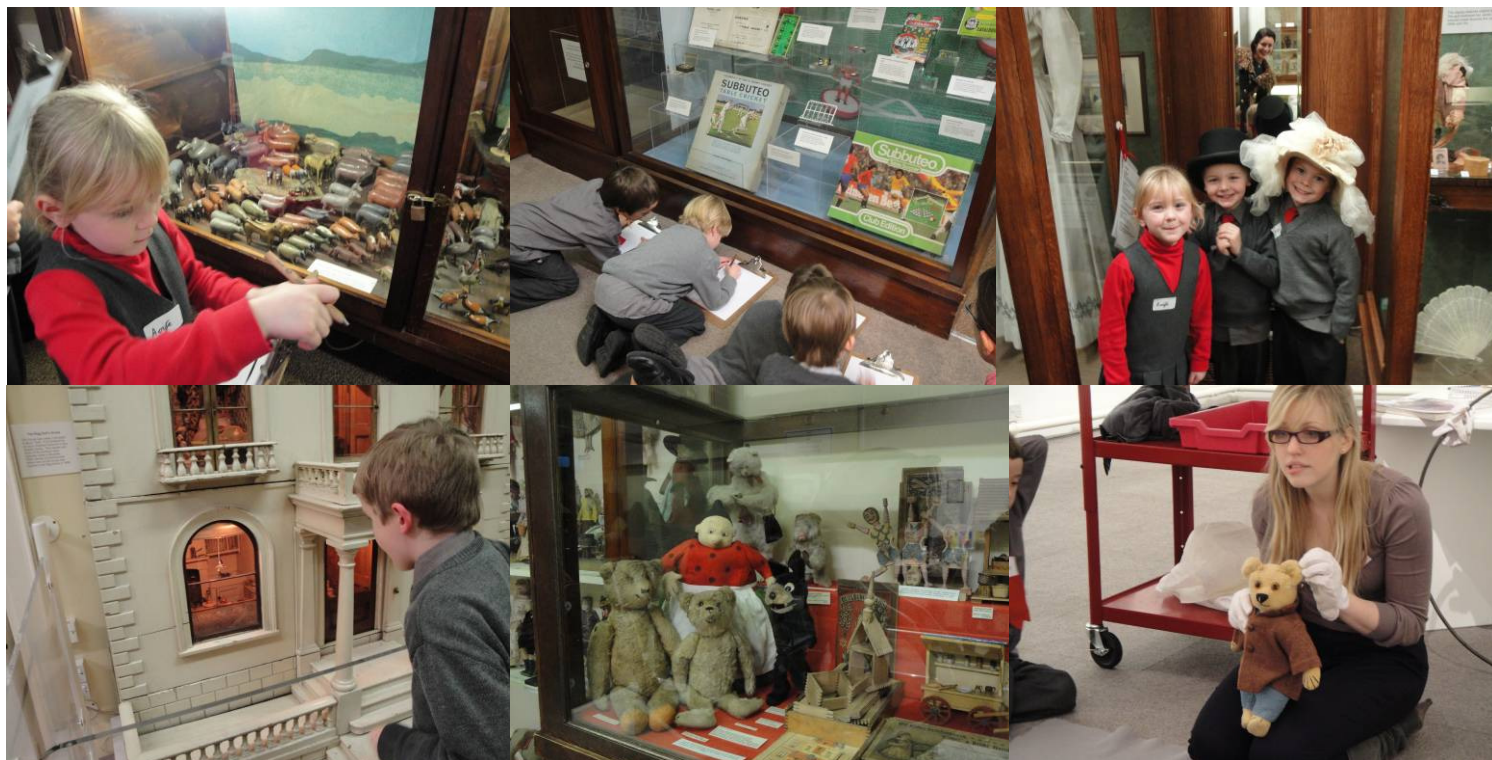
Year 1 enjoying a trip to the Toy Museum in Tunbridge Wells

Another busy and exciting week at Sacred Heart School where learning is fun!