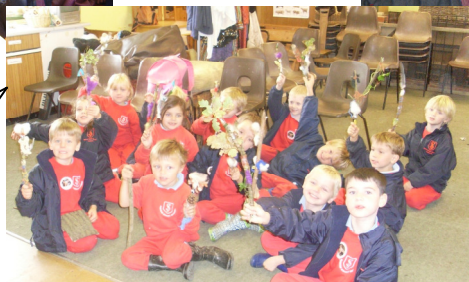
Y2 playing the woods at the Mohair Centre