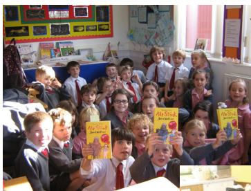
Y4 celebrating National Poetry Day

Another busy and exciting week at Sacred Heart School where learning is fun!