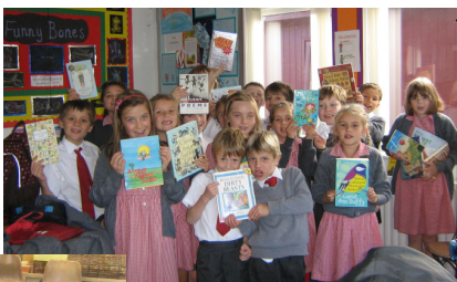
Y3 and Y4 reading Mr Stink before their visit to the Theatre